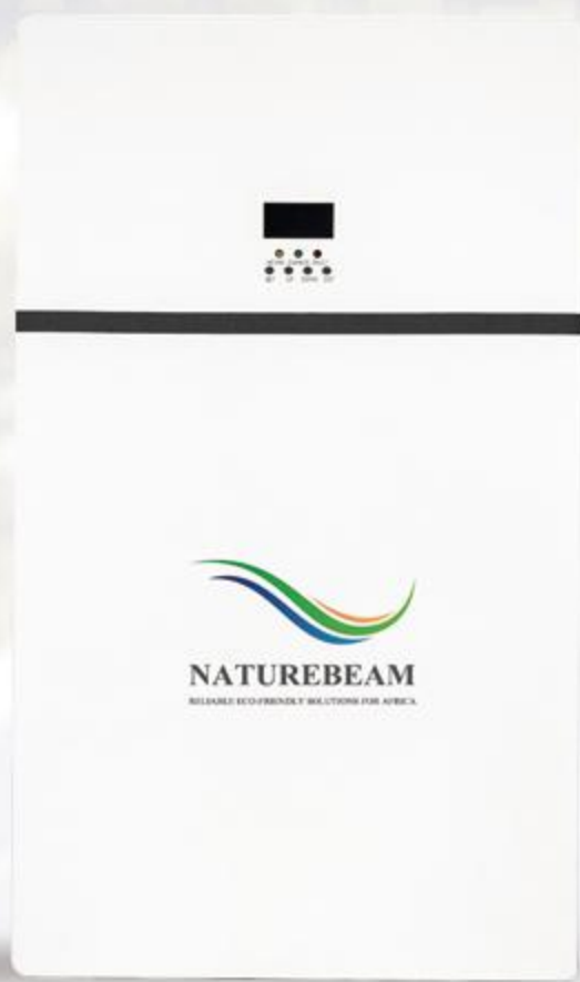
Intelligent breathing lamp